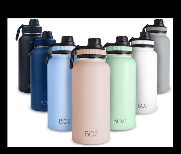
Stainless Steel bottles