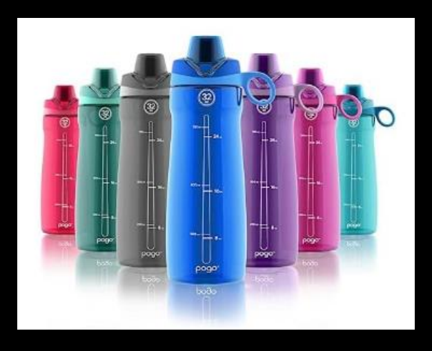
BPA free plastic bottles